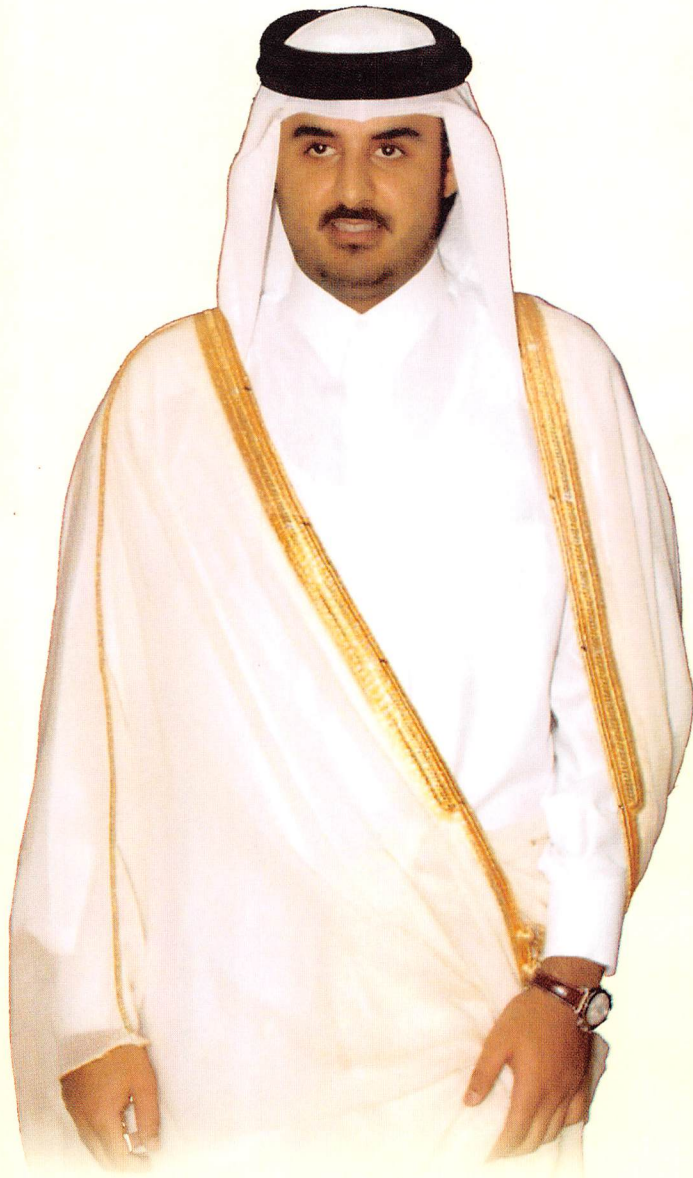
His Highness H.H Sheikh Tamim Bin Hamad Al-Thani The Heir Apparent